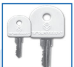
Master Key w/logo